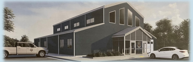
Rendering of the WTP Control Building Design

If you have questions about this project, please contact Rockland Miller at the Village Office (506-451-8508) or e-mail rockland.miller@vonm.ca .