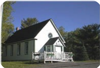
THE VILLAGE NEWS

A quaint heritage hall, built in 1918 with vaulted ceilings and restored original wood floors and washroom facilities. Our newly renovated kitchen makes this a beautiful facility for community events, celebrations and special rentals.